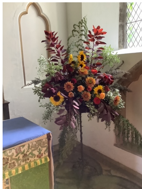
Harvest flowers at Lustleigh

We shall have a short Harvest Service at 6 pm, followed by refreshments. You are very welcome to bring some food and drink to share. Please note that it will be a candlelit service so you are advised to bring an appropriate torch!